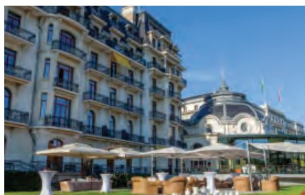
Beau Rivage Palace, Lausanne