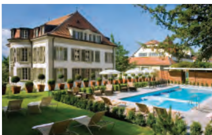
Angleterre et Residence, Lausanne

Just a short walk from Gstaad's main boutiques, cafes, and restaurants, Le Grand Bellevue is a highly convenient hotel immersed in the picturesque lifestyle of the Saanenland. Its pale yellow façade is palatial in design, with a distinctive tower that shapes some of the hotel suites. Equipped with a Michelin starred restaurant and an indulgent spa, this is a luxurious property in which to spend two or three nights while you explore the Saanenland.