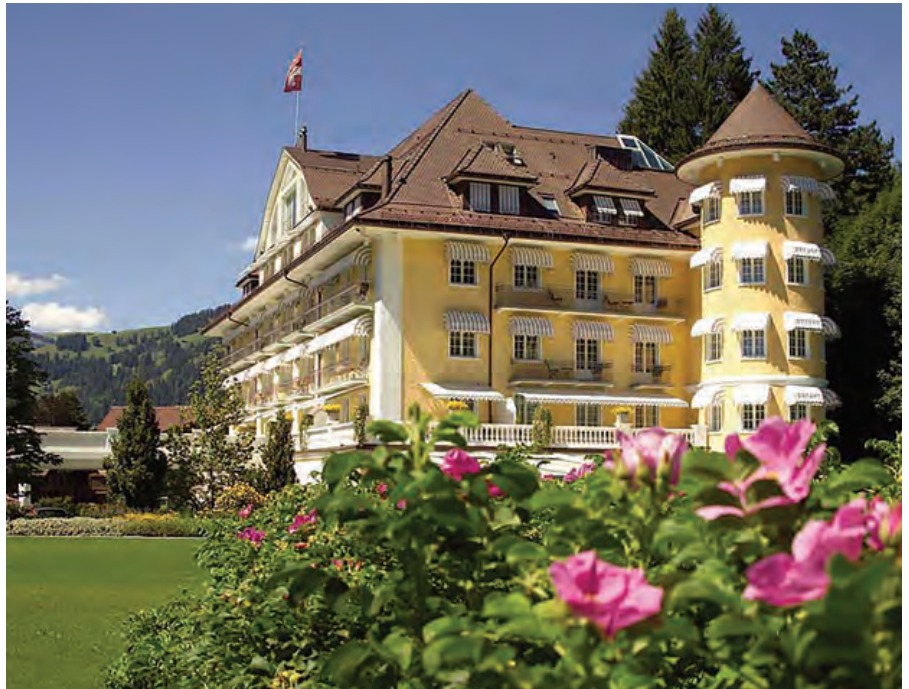
Le Grand Bellevue, Gstaad

On the banks of Lake Geneva in Lausanne, the Beau-Rivage Palace is a building equally as stunning as its location. Just a short distance from Ouchy, and with beautifully regal interiors, multiple dining options, and a well-equipped spa, this is the ultimate luxury address in Lausanne.